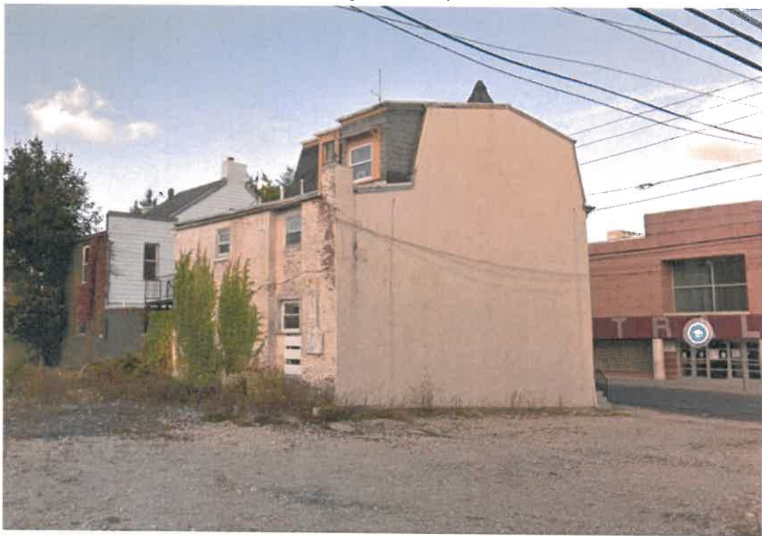
Side and rear of 828-30 W. Turner Street from Lumber Street, 2014.