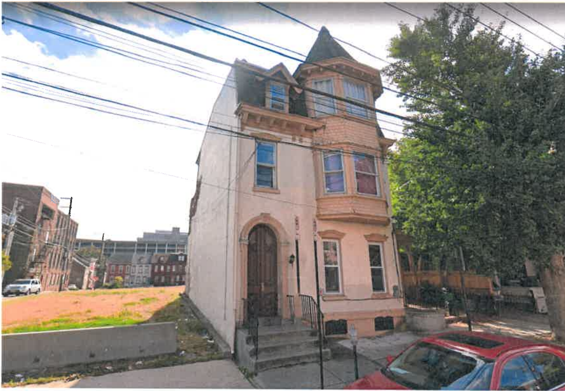
Front façade of 828-30 W. Turner Street, 2021.