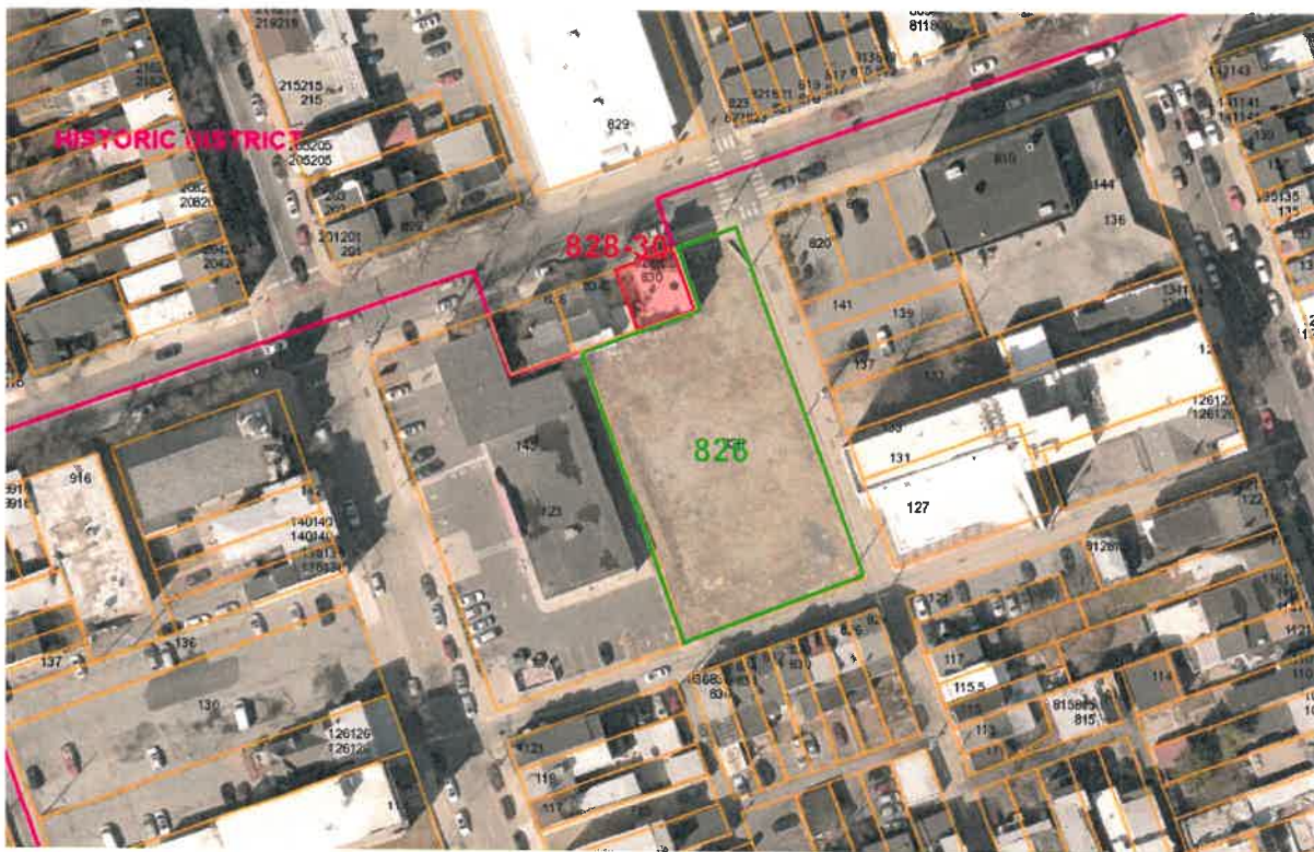
Aerial showing 828-30 W. Turner Street, the adjacent parcel at 826 W Turner Street, and the historic district boundary.

This application proposes the complete demolition of the property at 828-30 W. Turner Street. In October 2021, the Allentown City Planning Commission granted the applicant approval to construct an eight-story, multi-unit residential apartment building at the adjacent vacant lot at 826 W. Turner Street. The site is a former five-level parking structure that had been demolished in 2009. Since the demolition of the parking lot, the site had remained vacant, and construction of the apartment building recently commenced. At the time of the Planning Commission's approval, the applicant attempted to gain ownership of additional properties fronting Turner Street, including 828-30 W. Turner Street, but was unsuccessful. The applicant is now under agreement of sale for the property at 828-30 W. Turner Street and is seeking to demolish the property to provide additional frontage on Turner Street for the multi-unit residential apartment building. The property at 828-30 W. Turner Street is on the periphery of the Old Allentown Historic District boundary. The property at 826 W. Turner Street falls outside the district boundary.