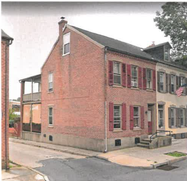
1024 W. Chew Street, 2019.

The applicant revised the application to show that the vent would penetrate the wall at approximately the height of the adjacent window sill to avoid creating an obstruction at the sidewalk.