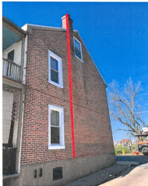
Original proposal: Red line showing roughly where the vent would be located. (staff added line)