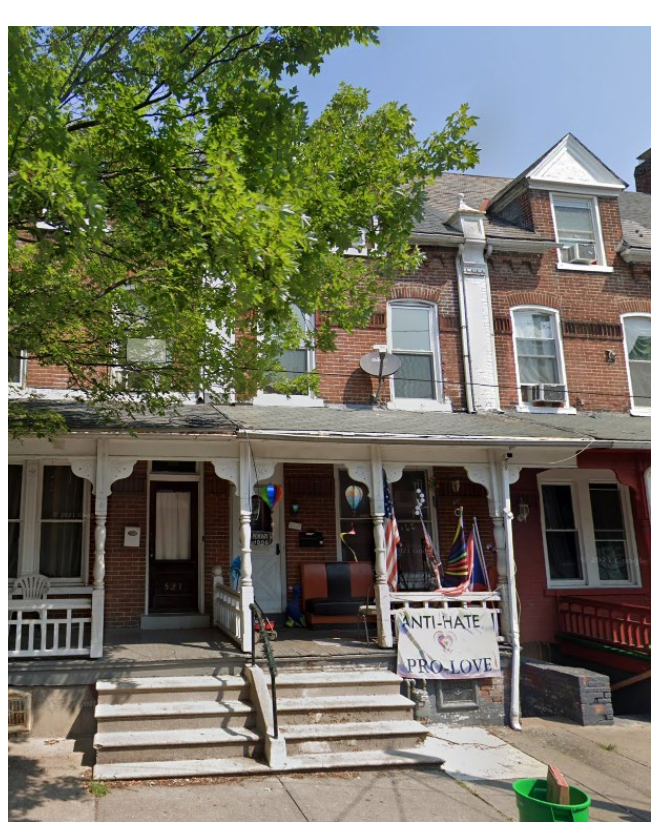
Front façade of 519 Liberty Street, 2021.

This application proposes to rebuild the historic porch by removing the existing roof and decking. The posts and railings would be salvaged and reinstalled. The porch roof would be reconstructed and would be clad in architectural shingles. New tongue and groove decking would be installed to replace the existing warped floorboards. The application further proposes to wrap the fascia in aluminum and install a vented vinyl soffit ceiling.