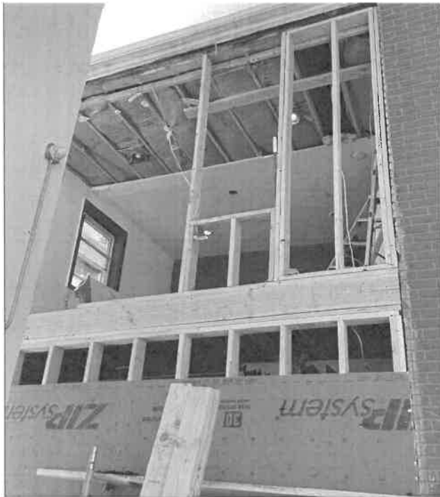
Side façade with walls removed and reframed.