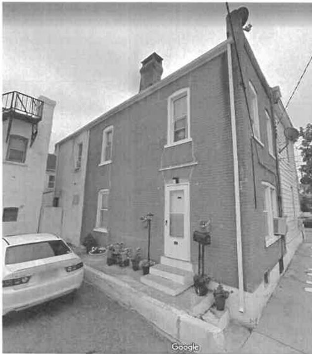
Front and side façades of 327 N. Nagle Street, 2019.

On May 25, 2023, the property owner submitted an application for a certificate of appropriateness to restucco the rear addition of the building at 327 N. Nagle Street. Staff approved the application since the work would have been an in-kind replacement. Staff was later notified by Building Standards and Safety that the work exceeded the approved scope and that Building Standards had issued a stop work order and tagged the building as unsafe. According to the inspector, the removal of the stucco showed that the addition was in extremely poor condition and in danger of collapse. Because the owner worked outside the approved scope, staff issued a notice of violation and revoked the certificate of appropriateness. The owner proceeded to work to address the unsafe violation prior to permits being issued and rebuilt the addition. Currently, the addition has been reframed, enclosed, and stuccoed. At least one door was relocated to a new façade. This application proposes to legalize the reconstruction of the addition.