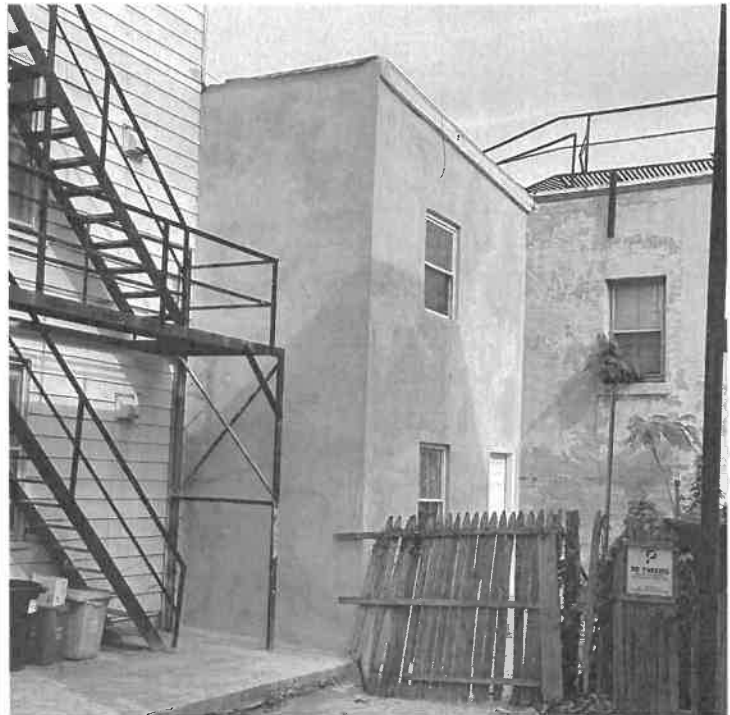
Rear of the rebuilt addition visible from Pine Street.