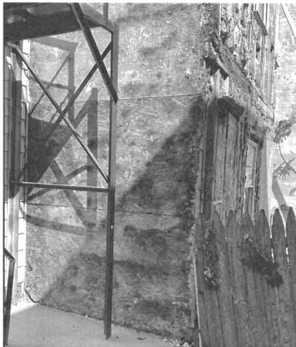
Photo showing the wall condition following stucco removal.