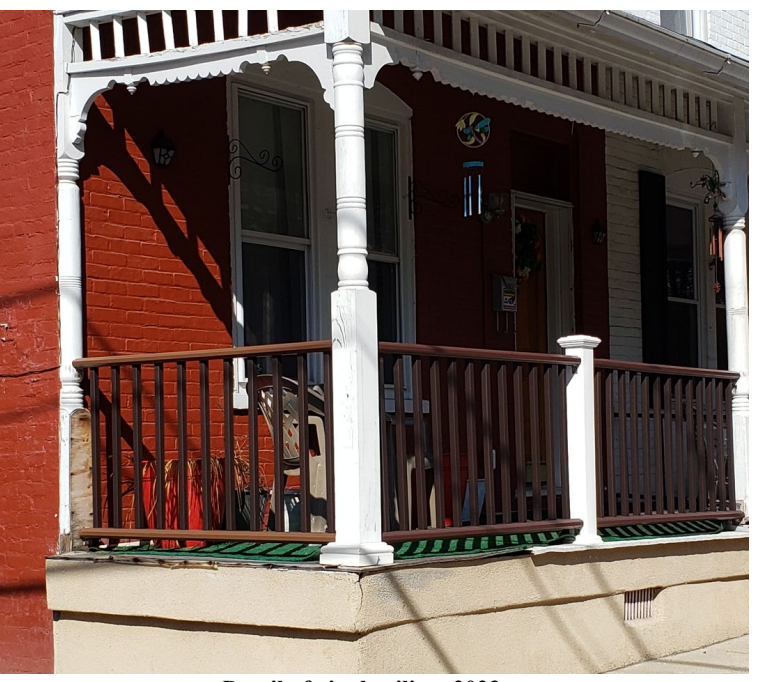
Detail of vinyl railing, 2023.