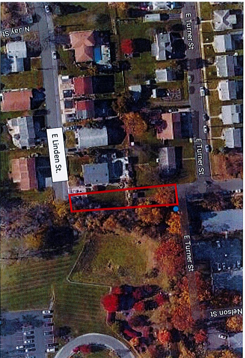
Aerial Overview of North Maxwell Street Proposed Vacation – Blue Dot Shows Location of Utility Pole –