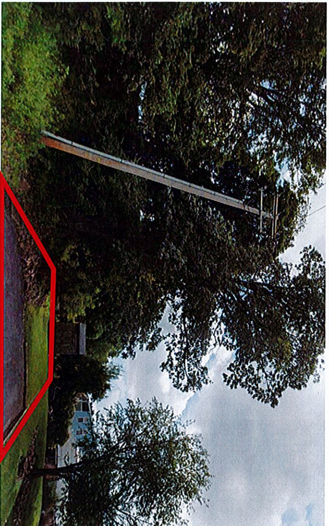
View of N. Maxwell St. proposed vacation from E. Turner St. - Showing Utility - Image courtesy of Google Street View