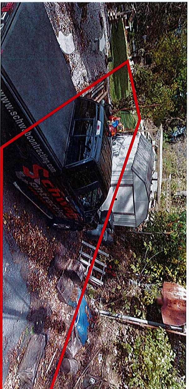
View of N. Maxwell St. Proposed Vacation from E. Linden St.