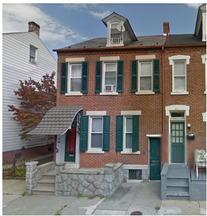
Front façade of 213 N. 11th Street, 2014.

This application proposes to replace the historic roofing at the property at 213 N. 11<sup>th</sup> Street. The property retains its historic slate at the main roof, dormer roofs, and dormer cheek walls. The applicant proposes to install IKO Dynasty asphalt architectural shingles in emerald green.