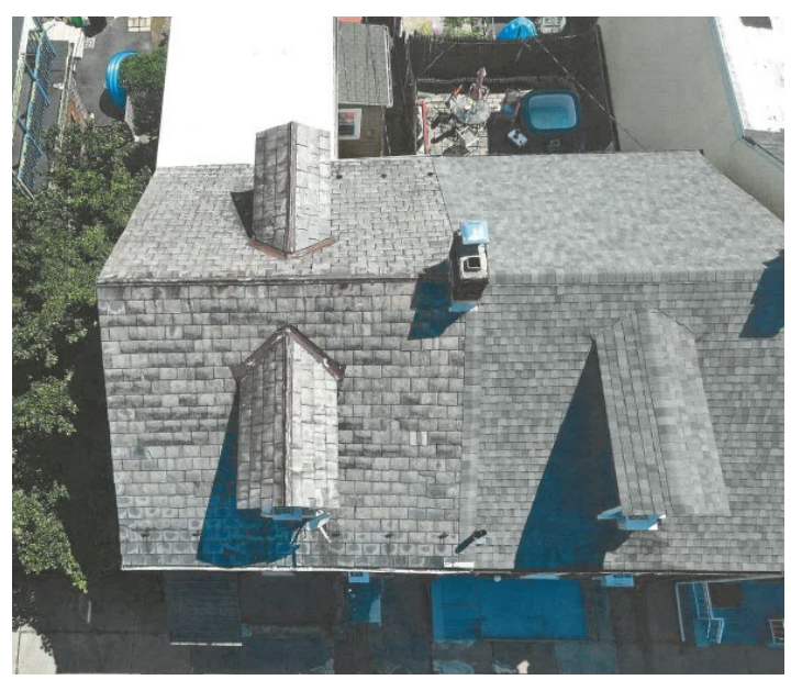
Front Roof Aerial of 213 N. 11th Street, 2023.