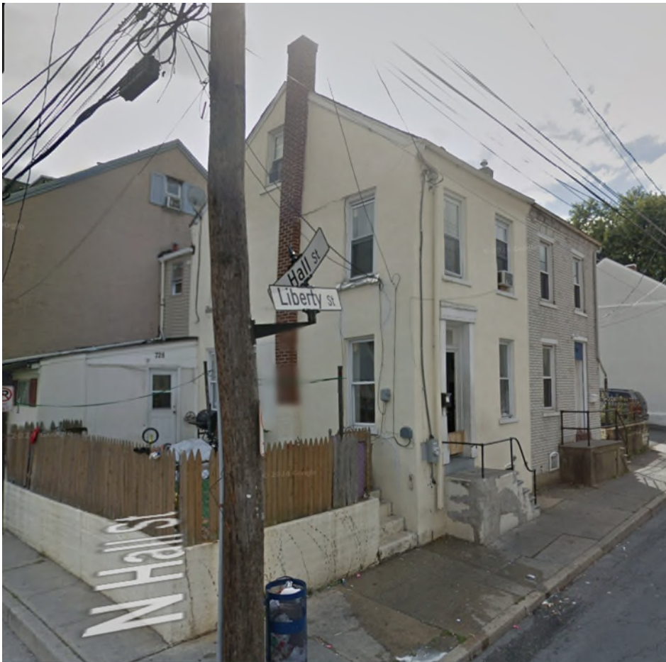
Street View (Google Imagery)