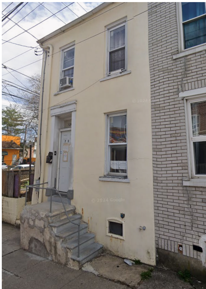
Front Elevation (Applicant)

The proposed work is install rooftop solar panels over the entirety of the roof.