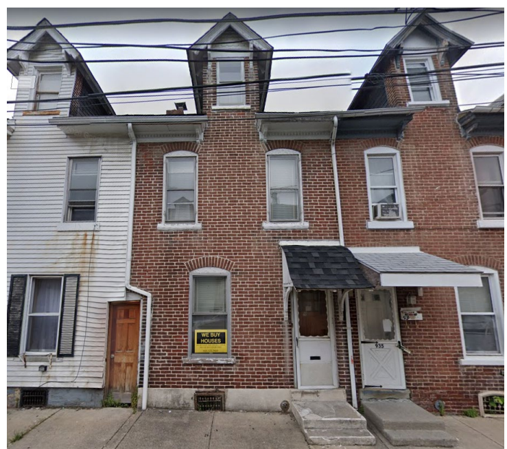
Front façade of 937 North Street, 2019.

This application proposes to install solar panels on the roof of the property at 937 North Street. The two-and-a-half-story building is located mid-block and has a gable roof over the main block with a flat roof at the rear ell. Three solar panel arrays are proposed, including one at the front slope, one at the rear slope, and a larger array over the rear flat roof. The disconnect would be installed with the utility meter at the rear of the property.