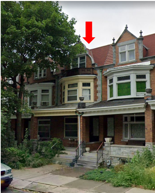
Front façade of 1611 ½ W. Turner Street, 2019.

This application proposes to replace the non-historic roofing at the property at 1611 ½ W. Turner Street. The property historically featured red slate at the front mansard and dormer roof and cheek walls. The entire roof had been replaced with asphalt shingles in the past. The applicant proposes to install GAF Timberline shingles in Patriot Red.