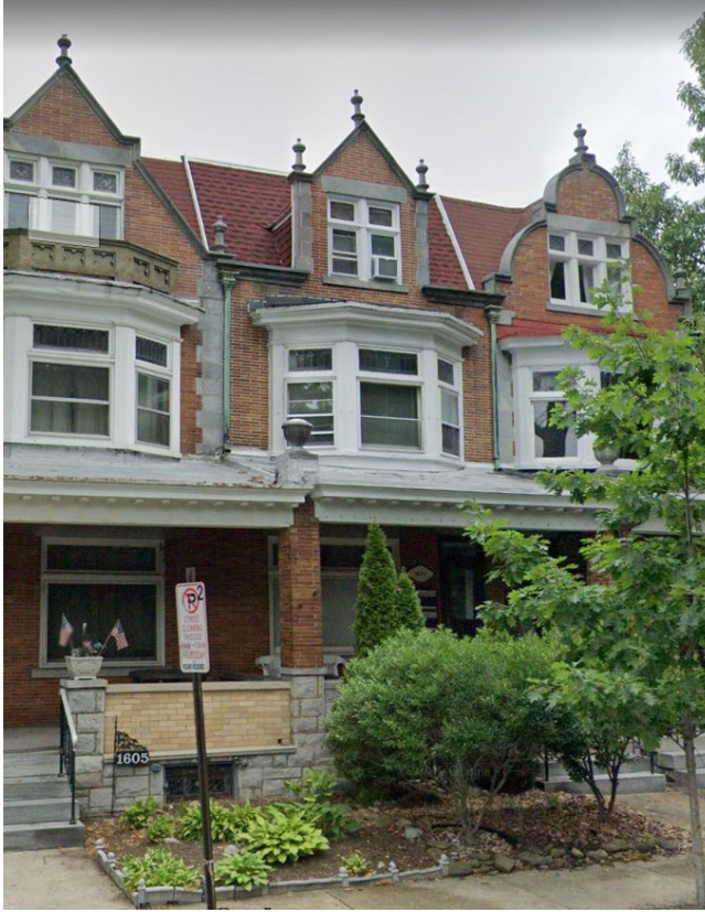
Similar shingles at 1603 W. Turner Street, 2019.