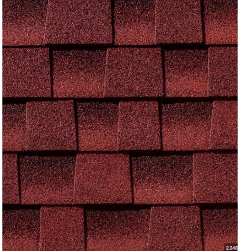
GAF Timberline shingles in Patriot Red. ( www.gaf.com )