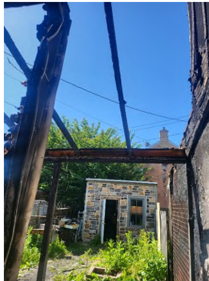
Fire Damage at Building Rear (Applicant)