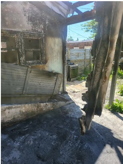
Fire Damage at Rear (Applicant)