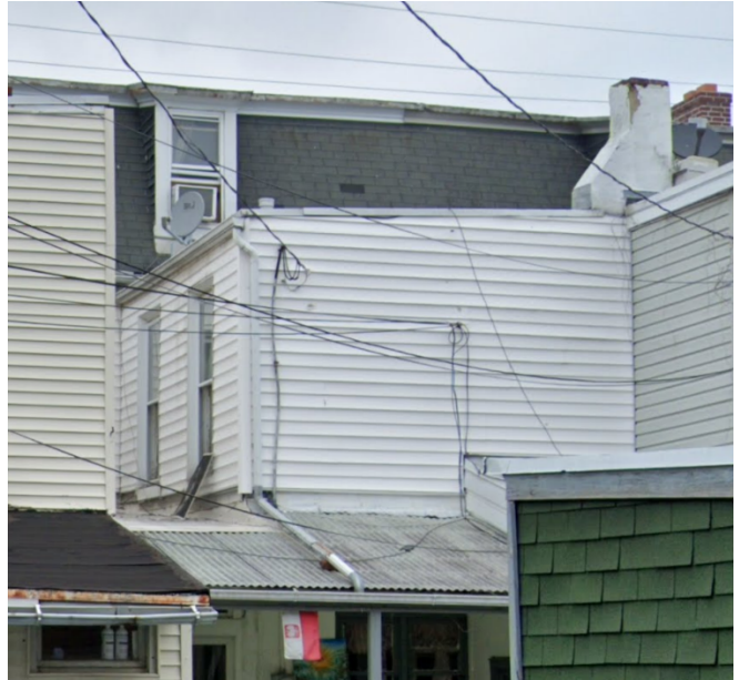
Rear of Property, 2019 (Applicant)