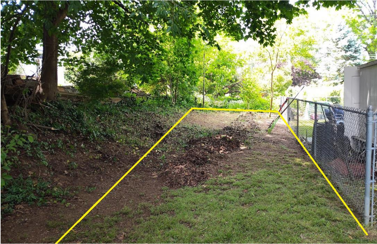
View of Ruhr Street looking North from area of Hill Street Area in Yellow is petitioned to be vacated.