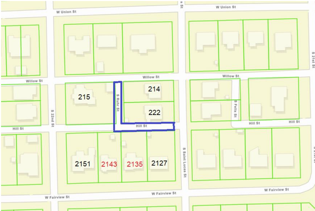
County of Lehigh County PA, data.pa.gov, New Jersey Office of GIS, Esri, TomTom, Garmin, SafeGraph, GeoTechnologies, Inc, METI/NASA, USGS, EPA, NPS, US Census Bureau, USDA, USFWS | Lehigh County GIS, Lehigh County IT Blue box are the areas petitioned to be vacated of rights-of-way