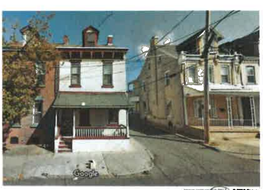
Albertonia, Premighique Georgia, Inc.