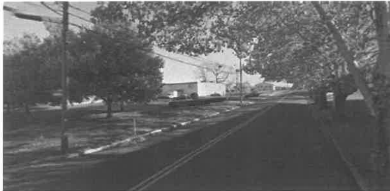
1047 N Irving St Allentown, PA 18109