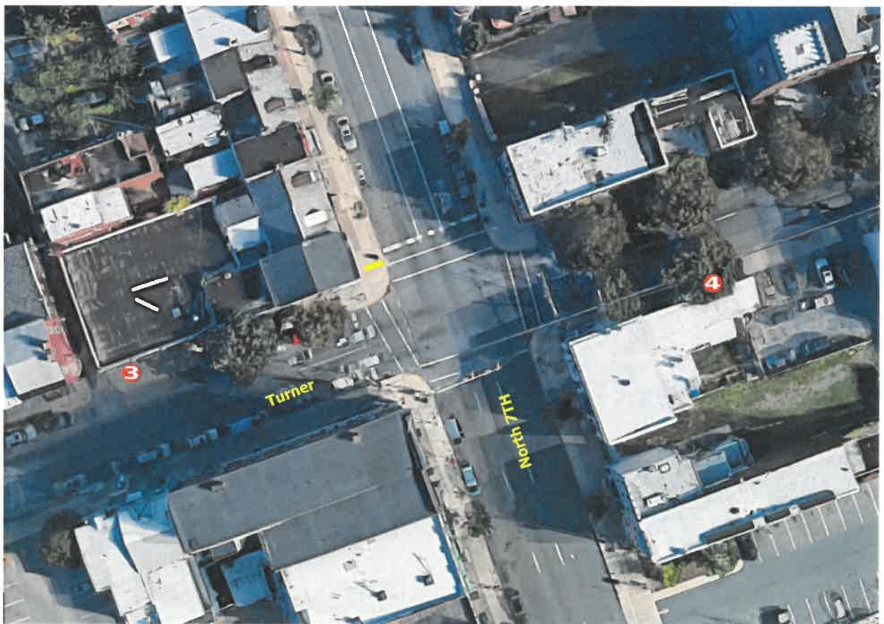
7TH and Turner