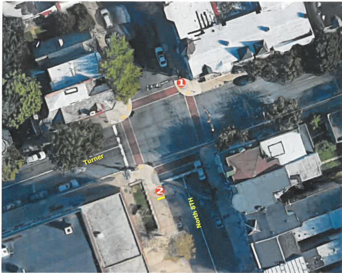
8TH and Turner