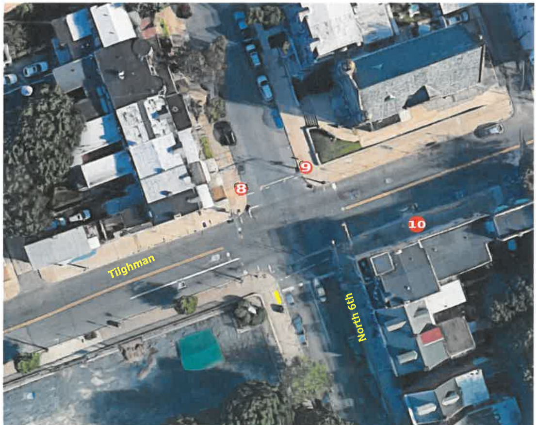
Tilghman and 6th