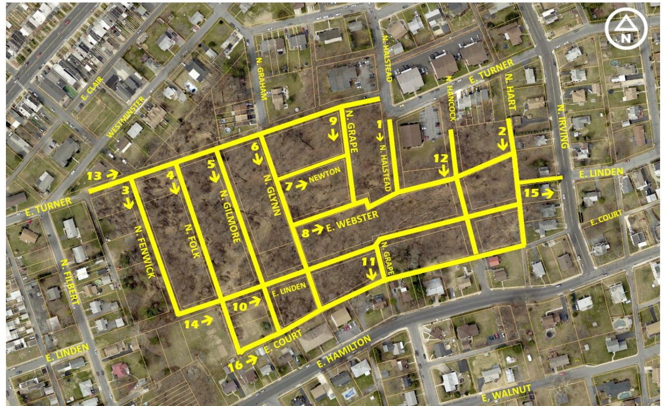
Figure 1. Aerial photo of the vicinity showing the streets proposed for vacation properties abutting those streets.

2. Planning records indicate that these same streets were reviewed in 2009 in conjunction with a proposed subdivision development called Common Ridge Estates in this location.