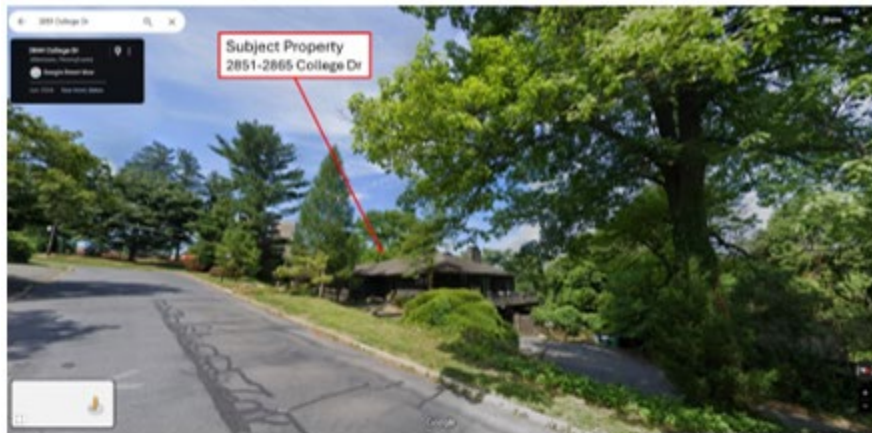
Figure C: Google Maps Streetview Images.