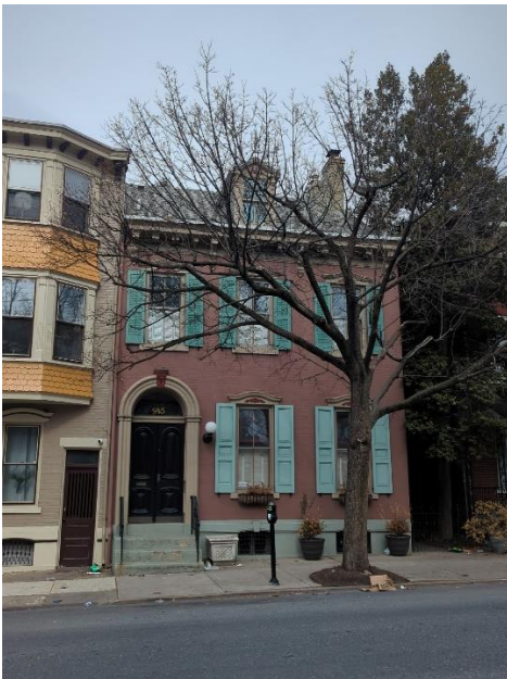
Front Elevation, Feb 2025

Project Description: Legalize stucco on damaged chimney due to improper gas venting system on entire chimney from roof upwards.