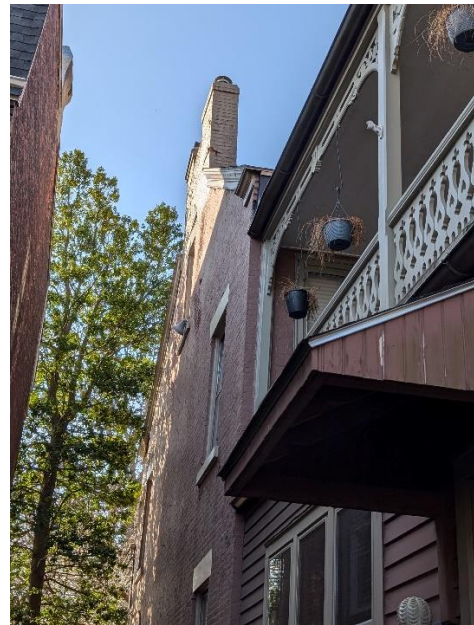
Chimney prior to work (Applicant)