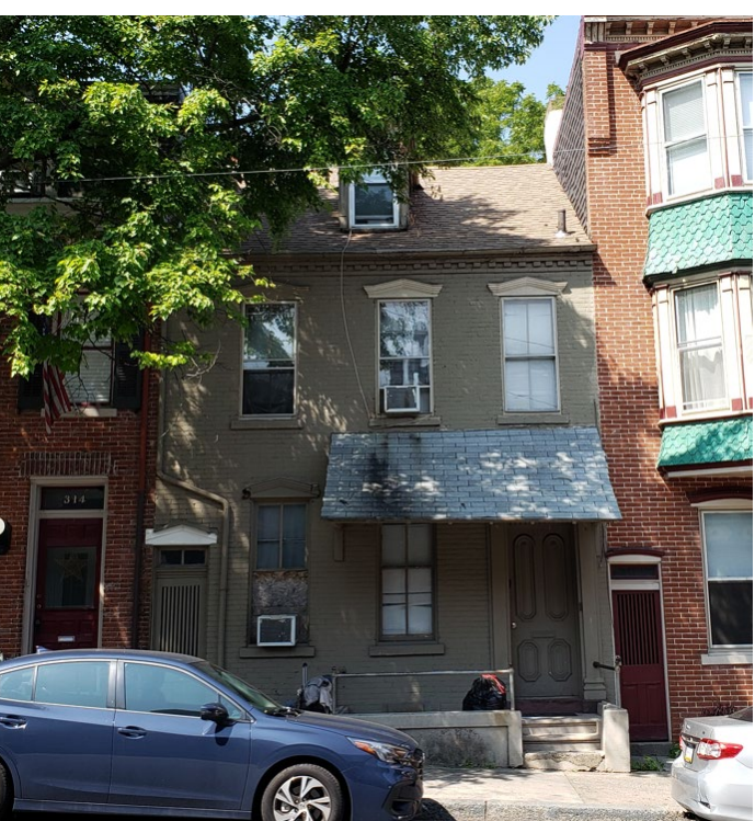
Back Roof Aerial of 213 N. 11<sup>th</sup> Street, 2023. (HARB files)