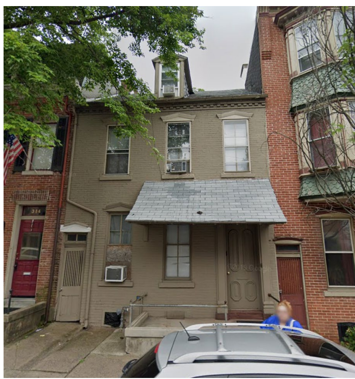
Front façade of 316 N. 8th Street before reroofing, 2019.

On August 10, 2023, staff issued a notice of violation for the reroofing of the building at 316 N. 8<sup>th</sup> Street without a Certificate of Appropriateness. This application proposes to legalize the asphalt shingles that were installed without permits or a COA. The applicant did not provide information on the shingle that was installed, though staff notes it is brown in color and has a variegated shape.