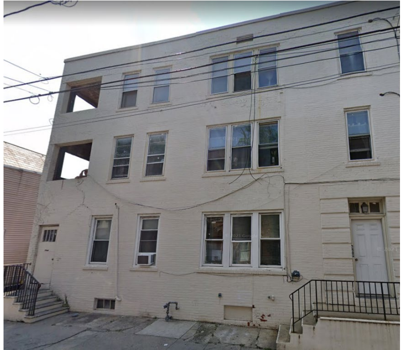
Liberty Street façade and fire escape before demolition, 2021.