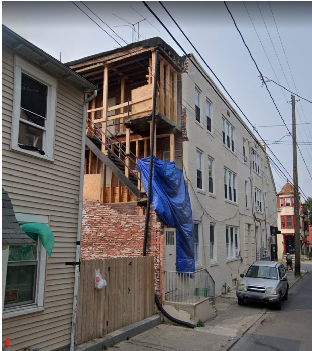
Liberty Street fire escape after demolition, 2023. (Google StreetView)