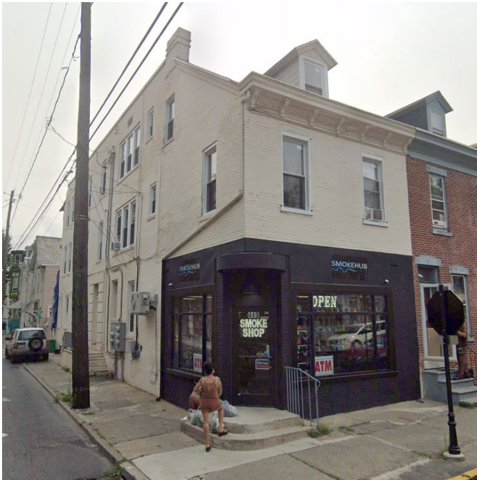
Front and side façades of 449 N. 10 th Street, 2023.

In June, a city inspector inspected the property and determined that the rear fire escape was unstable and a portion needed to be demolished and rebuilt. The owner notified staff and submitted an application for a certificate of appropriateness to demolish and rebuild the fire escape in kind. Because of the urgency of the repair, staff approved the application and requested that the applicant return with a restoration plan that may need to be reviewed by the HARB. This application proposes to rebuild the fire escape to its former appearance, though the walls would be frame with a masonry veneer rather than load-bearing masonry.