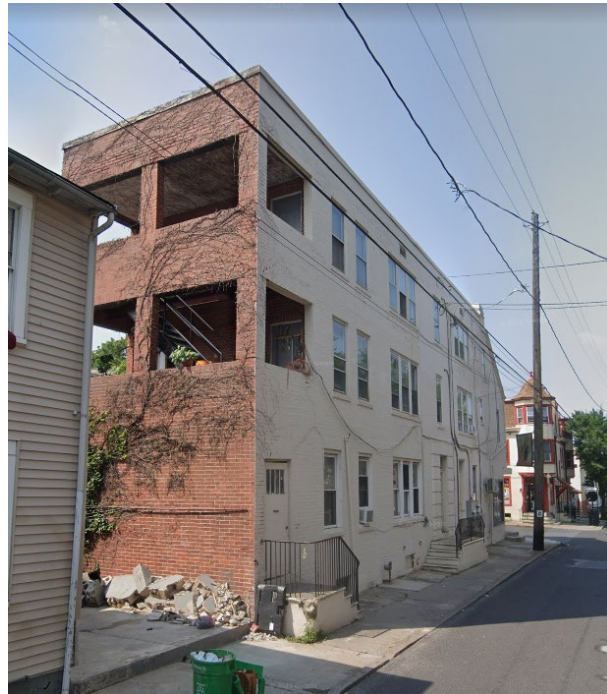
Liberty Street fire escape before demolition, 2021.