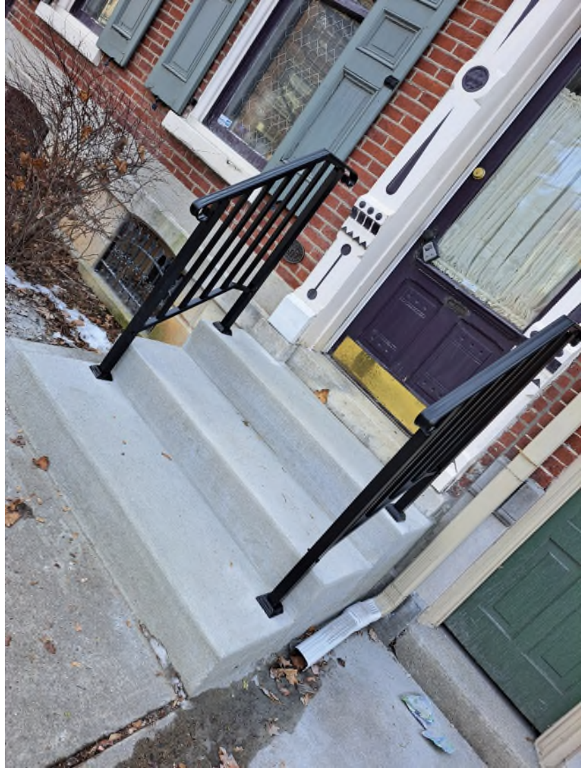
CURRENT CONDITION (APPLICANT IMAGE)