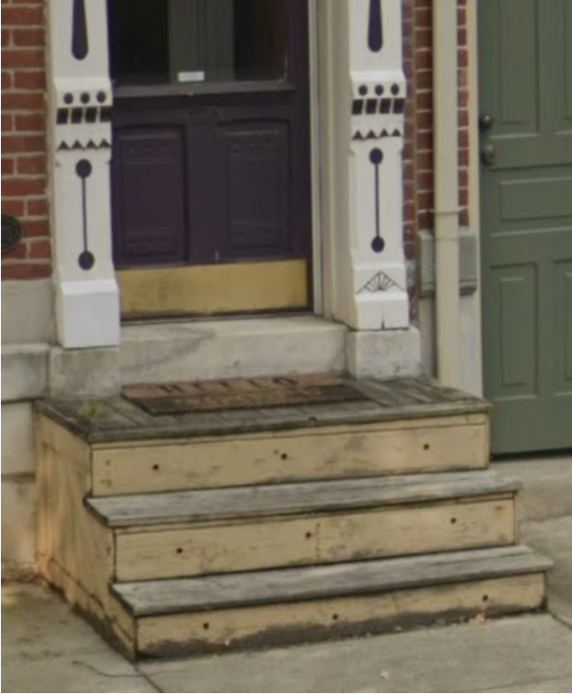
ORIGINAL STEP CONDITION (GOOGLE IMAGE 2023)