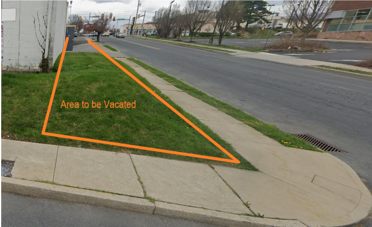
View of the frontage of 14 th Streer looking south from West Green Street