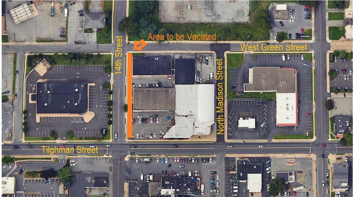
Aerial view of the area petitioned to be vacated.