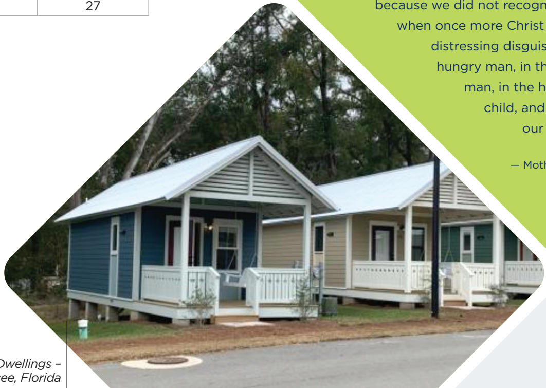
The Dwellings – Tallahassee, Florida