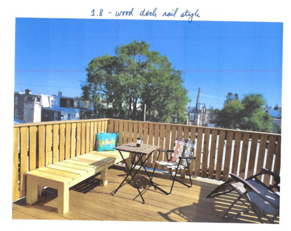
Example of proposed wood railing at roof deck. (Applicant)