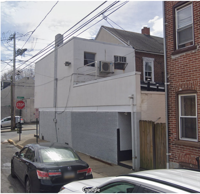
Building rear along Park Street (Google Maps, April 2024)