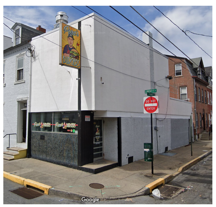
Front corner elevation