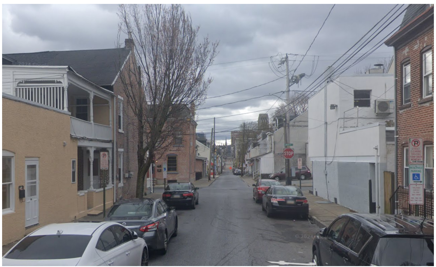
View from Park Street. 623 Liberty is on the left, and subject property 625 Liberty is on the right (Google Maps, April 2024)