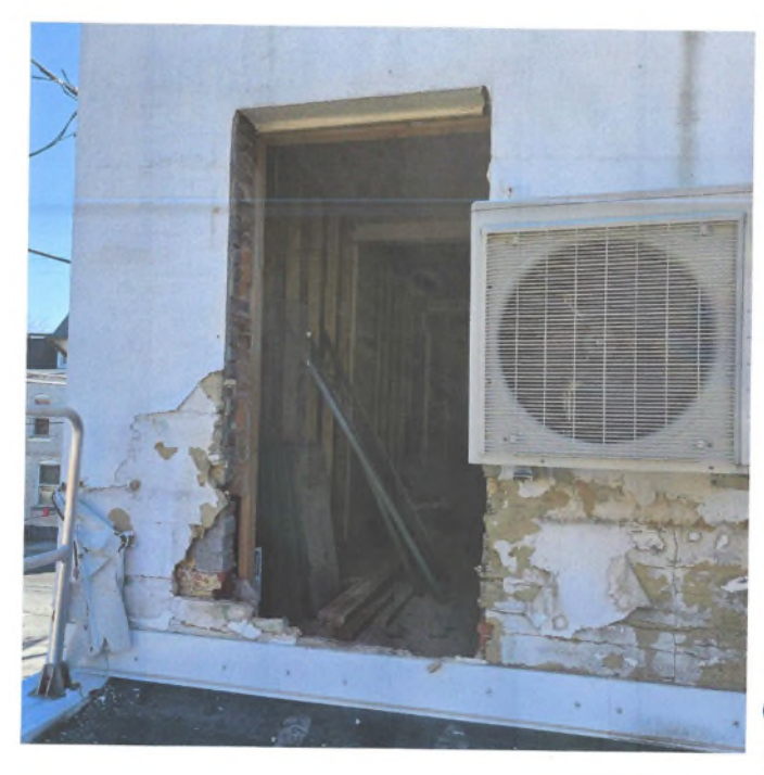
1. C Door opening (No frame) forend - proposed new door for war dech - the ested win dow fell out during denso which in itiated all this additional