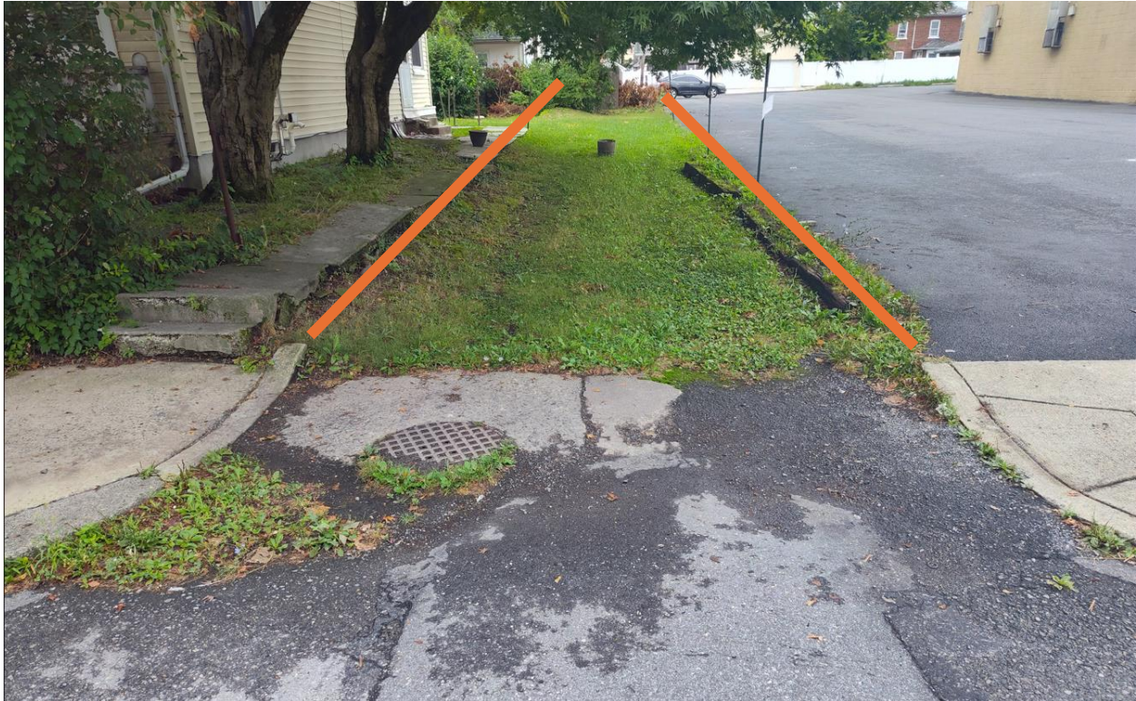
View of E. Clay Street looking west from Club Avenue, with orange lines depicting the width of the area petitioned to be vacated.