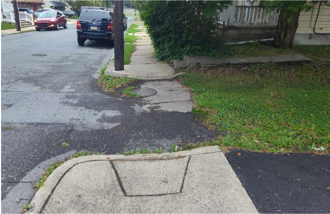
View of Club Avenue frontage at curb cut for the area of E. Clay Street petitioned to be vacated looking south.