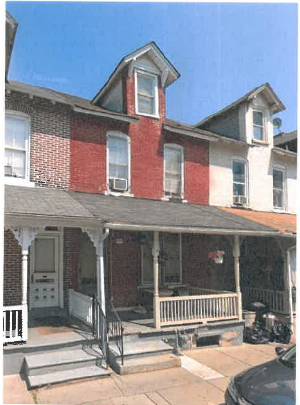
621 W. Liberty Street prior to reroofing, 2021.