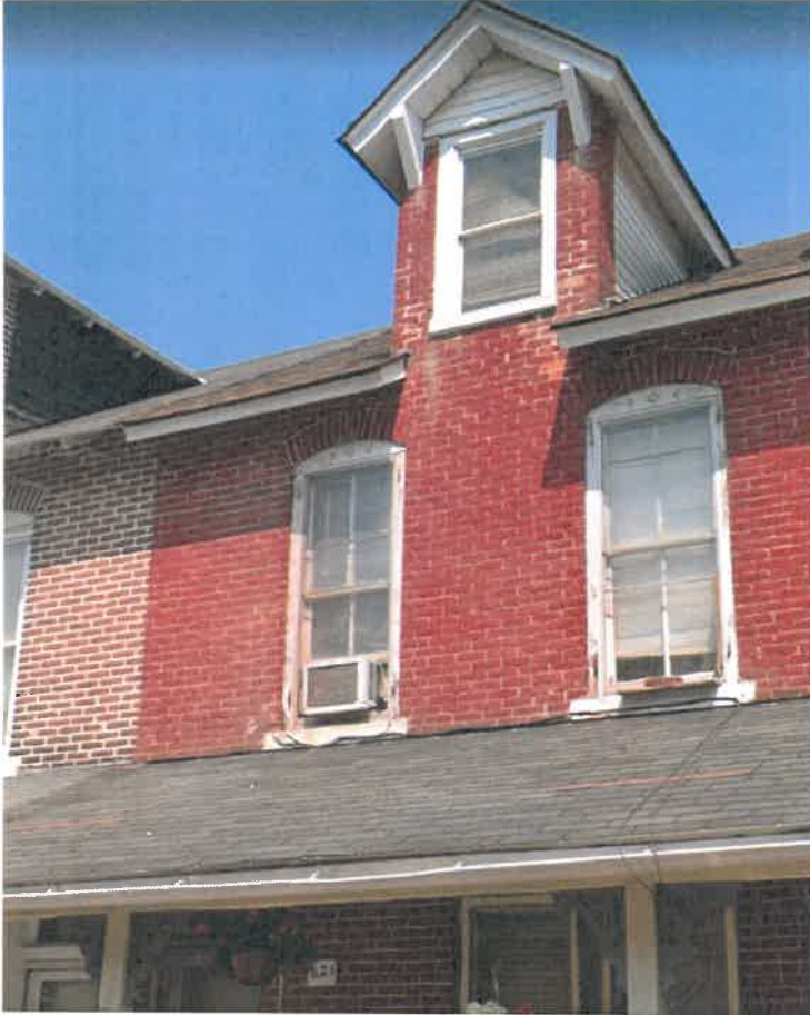
621 W. Liberty Street prior to reroofing, 2021.