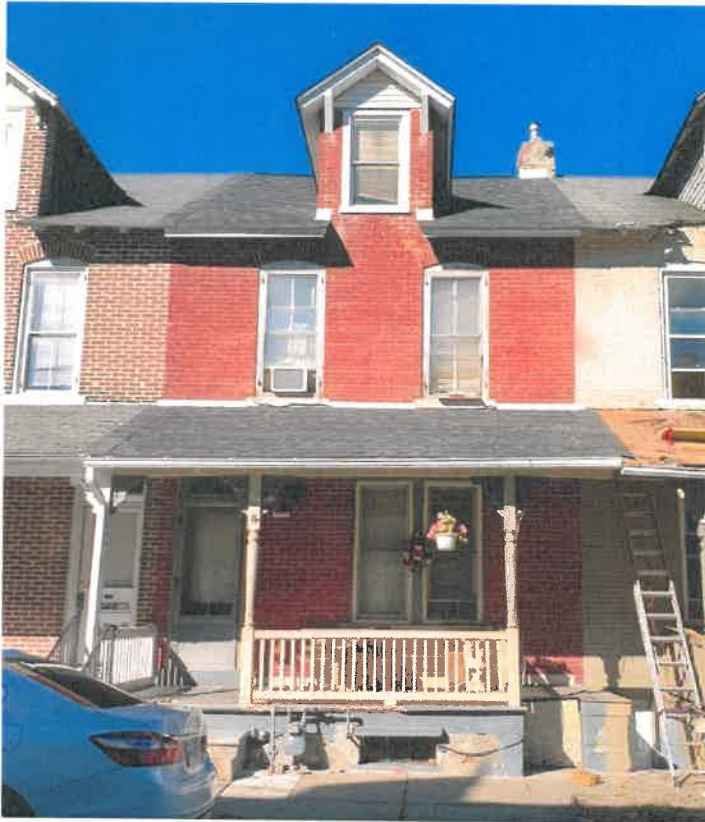
621 W. Liberty Street after replacement, November 2022.

This application proposes to legalize the installation of Atlas Pinnacle Pristine shingles in a black color on the main gable roof and front porch roof. The roofing prior to work was a 3-tab asphalt shingle. No loss of historic slate resulted from the roofing replacement.