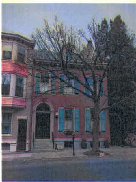
Front Elevation, Feb 2025

Project Description: Legalize stucco on damaged chimney due to improper gas venting system on entire chimney from roof upwards.