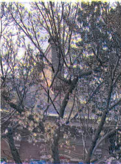
New stucco (Applicant)