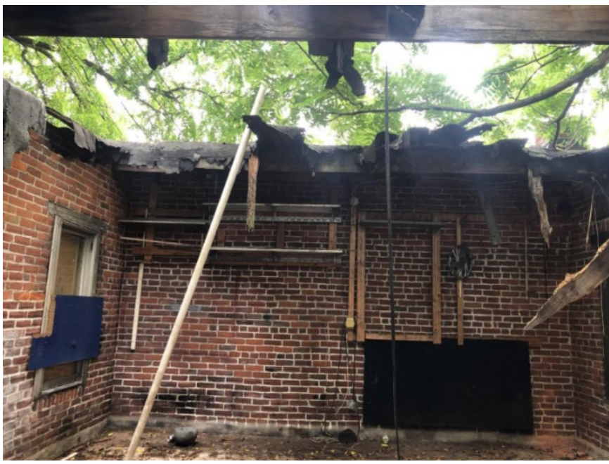
Interior of the garage at 948 North Street. (Applicant)