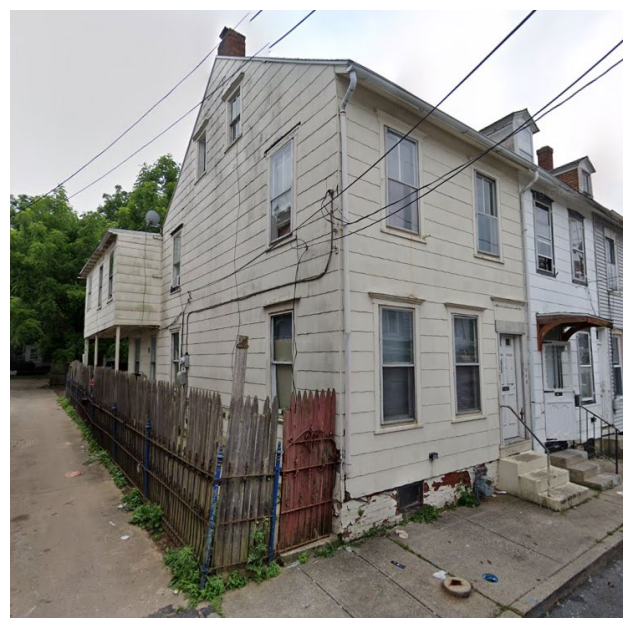
The main structure of 948 North Street in 2019.

This application proposes to demolish the one-story brick garage of 948 North Street. The garage is located at the rear of the property, at the intersection of Palm and Brush Streets, with frontage on Palm Street. The roof collapsed at some point in the past, leaving the garage susceptible to the elements and causing further deterioration. On August 22, 2022, a city inspector from the Department of Building Standards and Safety designated the garage as an unsafe structure and ordered that it be razed or repaired within 30 days to abate a public safety concern. Owing to the extent of the damage, the owner is seeking to demolish rather than repair the structure.