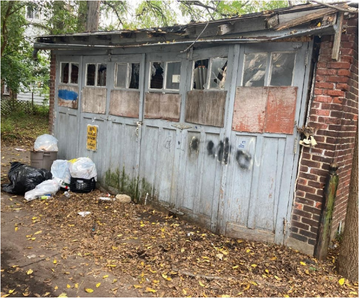
Rear garage of 948 North Street. (Applicant)